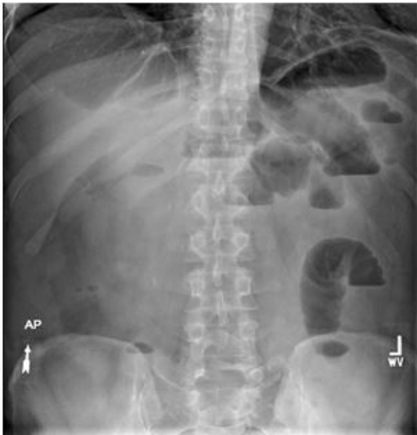
Image 1. Abdominal radiograph with numerous dilated small bowel loops with air-fluid levels.

Based upon these findings, there was concern for retained appendix in addition to small bowel obstruction and intra-abdominal abscess. Antibiotic coverage with IV piperacillin/tazobactam was started and the patient was admitted to general surgery. Diagnostic laparoscopy was performed that day, and in the operating room inflammation of the parietal peritoneum was noted as was a large purulent pocket located below the patient's largest prior periumbilical port site. Additionally, a necrotic appendix was visualized and removed. Further examination demonstrated that the appendix specimen contained a staple line across the base of the appendix containing an appendicolith (Image 3). The patient was discharged seven days post operatively after resolution of a post-operative ileus. He followed up outpatient with general surgery eight days after discharge and reported no further complaints. Pathology report from the specimen retrieved during surgery was consistent with appendiceal tissue.