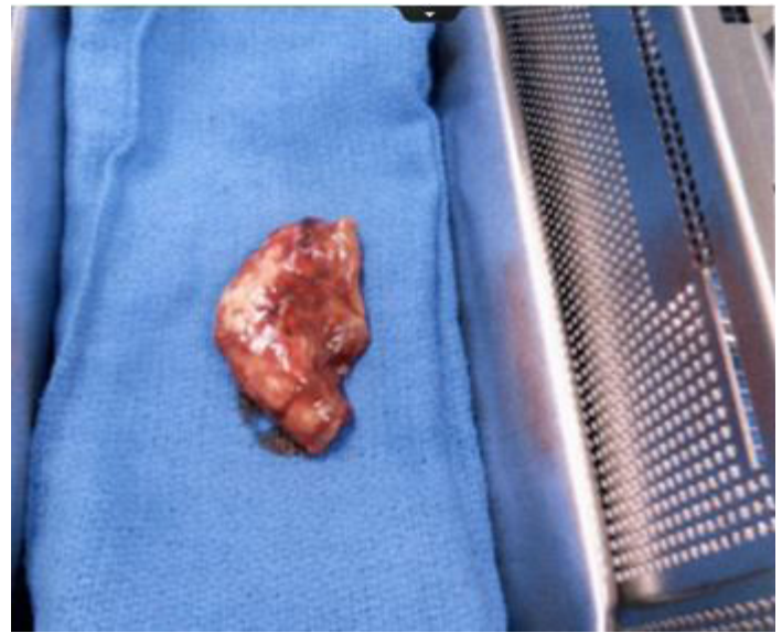
Image 3. The specimen retrieved in the operating room was a necrotic appendix.

As emergency physicians, it is crucial for us to include these rare surgical complications in our differentials, alongside the more common pathologies when approaching and treating our patients with abdominal pain.