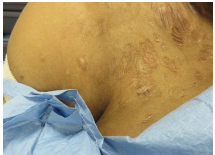
Figure 1.: Numerous soft, atrophic, hyperpigmented, nontender papules coalescing into sharply demarcated, depressed plaques on the neck and axillae.

LABORATORY DATA: An antinuclear antibody (ANA) test was positive at a titer of 1:640 and speckled pattern. The anti-Ro/La antibody test was negative. Testing for human immunodeficiency virus was negative. A rapid plasma reagin test was negative. Testing for an antiphospholipid antibody was negative, which included a negative lupus anticoagulant, a negative anti-beta-2 glycoprotein antibody, and a negative anti-cardiolipin antibody.