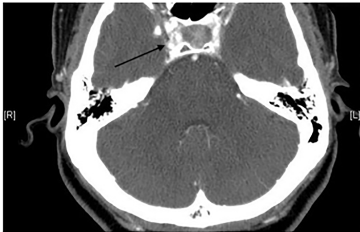
Image 3. Computed tomography of the orbits with intravenous contrast, axial image, demonstrating a large right draining vein into the cavernous sinus (arrow).