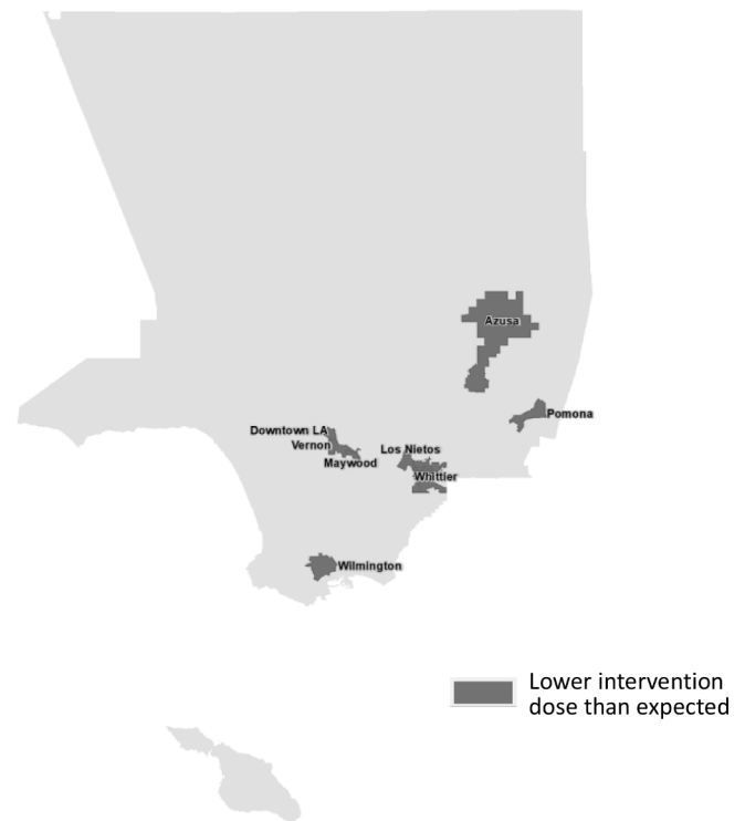
Fig. 3. Neighborhoods that received a lower intervention dose than expected based on neighborhood levels of obesity and sociodemographic characteristics in Los Angeles County between 2005 and 2015. Neighborhoods were identified by comparing neighborhoods' observed intervention dose with its predicted intervention dose based on neighborhood level of obesity prevalence and sociodemographic characteristics and the model: InterventionDose = \beta_0 + \beta_1 ObesityPrevalence + \beta_2 Poverty + \beta_3 Education + \beta_4 Minority .

We found evidence that interventions implemented in LAC during 2005 to 2015 were directed toward vulnerable communities. Specifically, ZIP Codes with higher obesity prevalence and those with poor socioeconomic profiles tended to receive more intervention strategies. Our findings suggest that rates of poverty and the concentration of racial/ethnic minority residents have influenced the distribution of funds for obesity prevention in LAC, and that both macro- and micro-level interventions (see Appendix A for examples) supported by large-scale initiatives designed to promote child well-being in LAC have had an impact on childhood obesity.