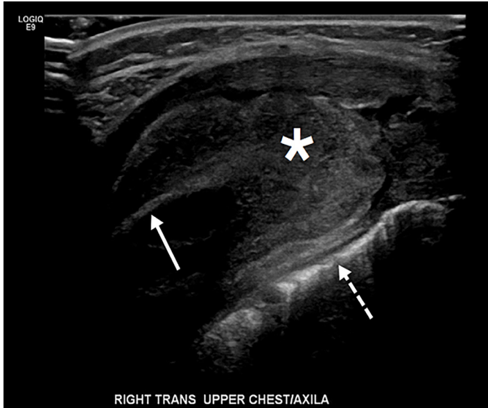
Image 1. Formal ultrasound of right upper chest/axilla showing rib (arrow), lung border (dashed arrow), and periosteal abscess (*).

Repeat blood cultures obtained after antibiotic therapy were negative, and the patient's fevers were less frequent. He was transitioned to oral cephalexin and observed. On hospital day six, the patient's mother noted a 2x4 centimeter tender, non-erythematous mass in the right axilla. Formal ultrasound showed a soft tissue mass adjacent to the rib, without a definitive fluid collection (Image 1). The patient was transferred to a specialized pediatric hospital where magnetic resonance imaging (MRI) revealed that the axillary mass was consistent with osteomyelitis and subperiosteal abscess of the lateral seventh rib (Image 2). The patient had operative debridement and thereafter made a full recovery with discharge home on hospital day 12.