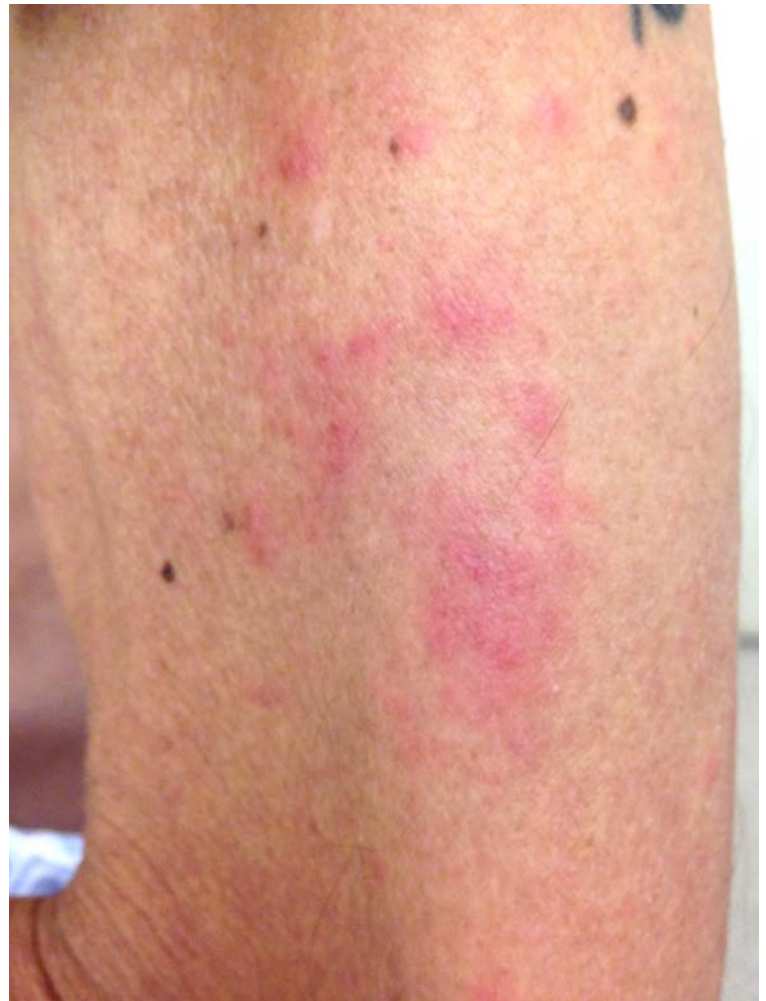
Figure 1,2. Erythematous papules on day 1