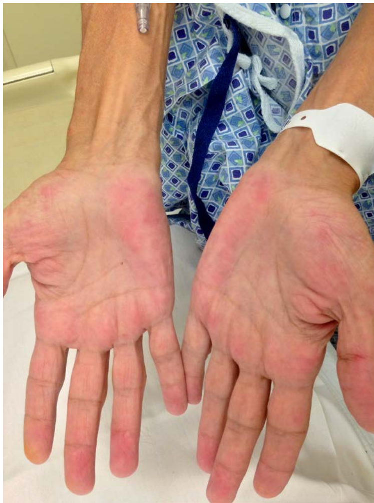
Figure 3. Palmar hands on day 1 of cutaneous eruption demonstrate several scattered juicy, erythematous papules.

Two 6mm punch biopsies were performed on unexcoriated papules on the left arm for histologic evaluation and tissue cultures. Histopathologic findings revealed neutrophilic eccrine inflammation and very focal granulomatous inflammation around a nerve. Grocott's methenamine silver (GMS), AFB, and Fite stains were all negative, but cutaneous tissue cultures were positive for MAC. The above history and physical support a diagnosis of disseminated cutaneous MAC infection.