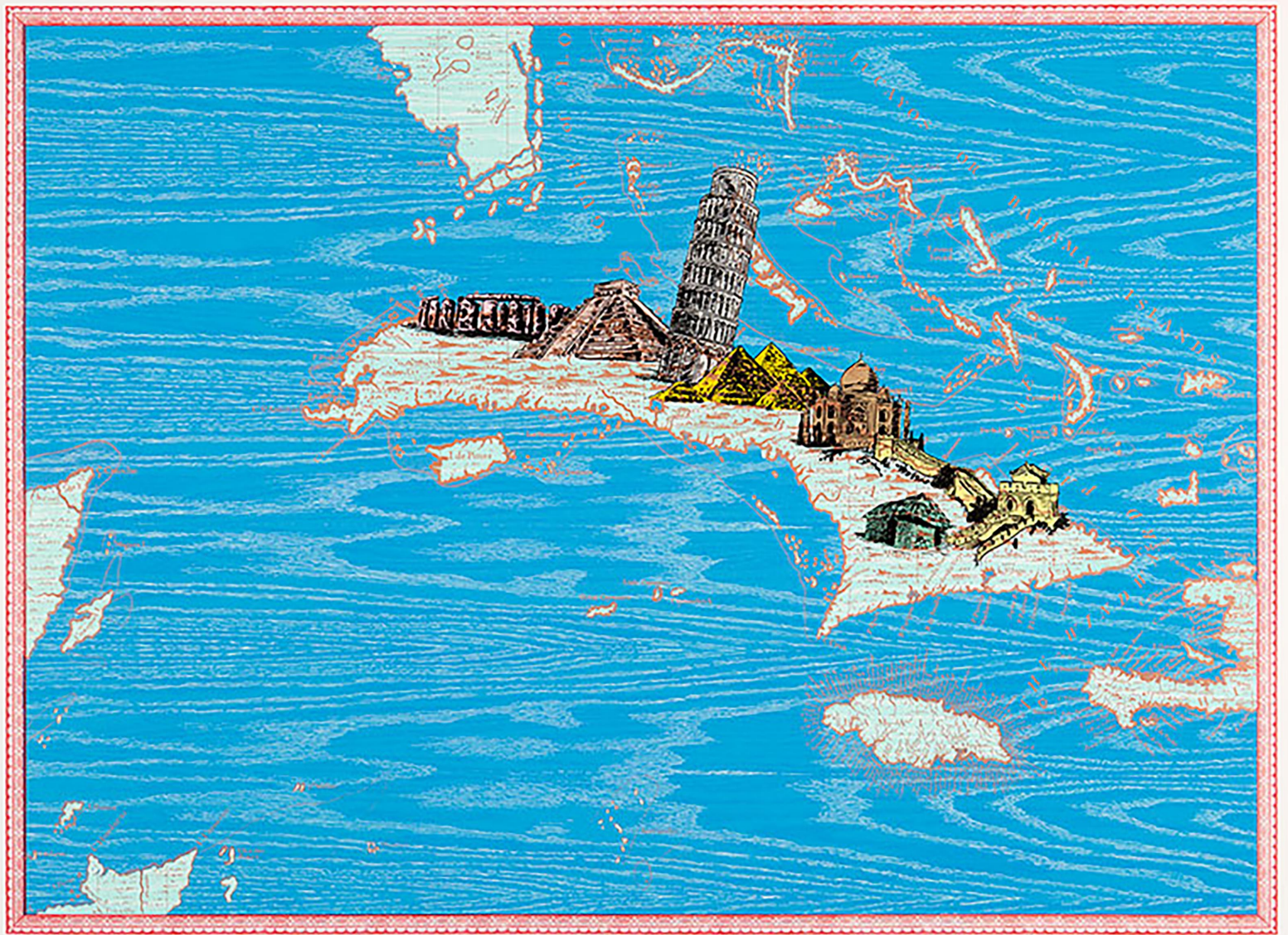
Figure 4. Ibrahim Miranda, Isla laboratorio o 7 maravillas (Island Laboratory or 7 Wonders), 13-color screenprint/woodcut, edition of 50, 44 × 57.5 in (111.8 × 146.1 cm) Copyright Ibrahim Miranda, images courtesy of Couturier Gallery, Los Angeles, CA