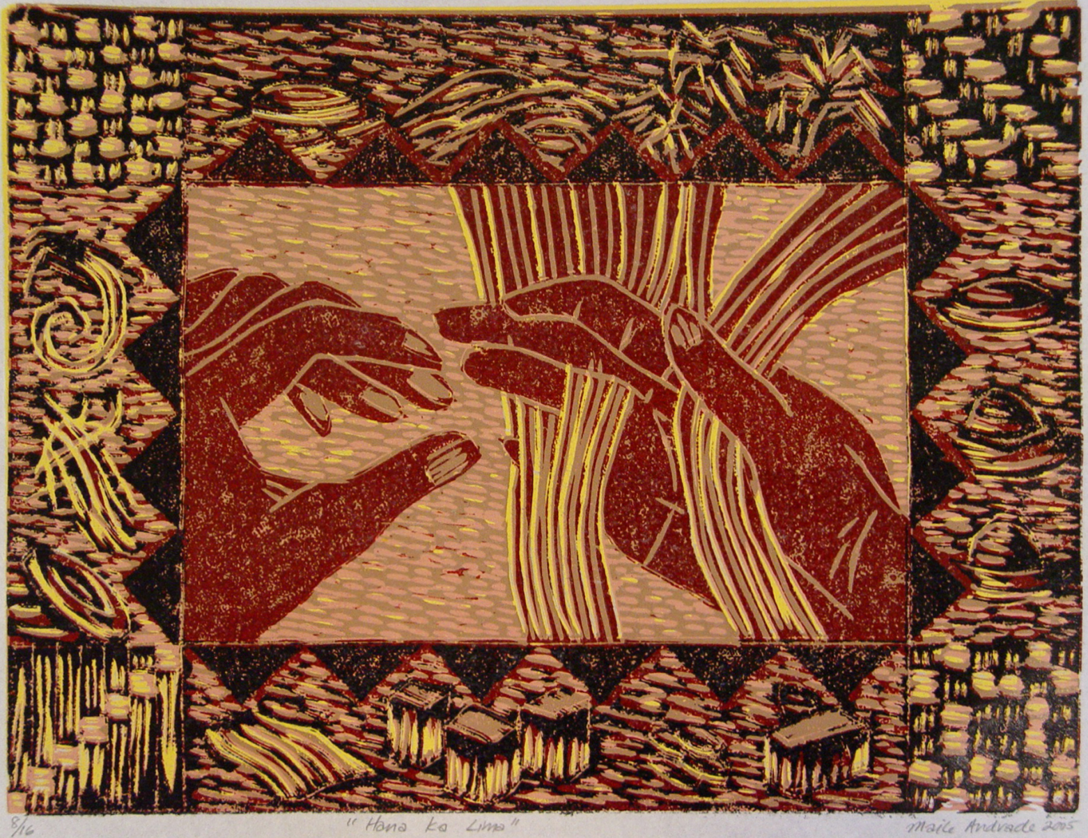
Figure 3. Maile Andrade, Hana ka Lima , print, edition of 16. Courtesy of the artist.

Ibrahim Miranda's Isla laboratorio o 7 maravillas or Island Laboratory of 7 Wonders was completed in 2012 and is a thirteen-color screenprint and woodcut measuring forty-four by fifty-seven and a half inches. Resonant with other mappings he has done, it shows Cuba central and large, though the many other smaller islands of the Cuban archipelago (including more than four thousand islands and cays) are featured in scale. Other nearby Caribbean islands and archipelagoes are also featured