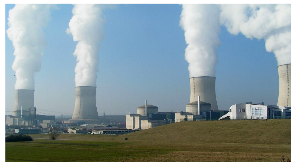
Figure 2: A nuclear power plant in Cattenom, France. France's nuclear energy accounts for 76.3% of its total electricity production. The stacks rising out of the four large towers in this image are made of steam and are harmless.

when it comes to nuclear has scared the public and policymakers away from a potentially planet-saving energy source.<sup>19</sup> But the merits that nuclear has over its alternatives, coupled with the pressing threat of climate change, make it more than worthwhile to reconsider our attitudes towards nuclear energy.