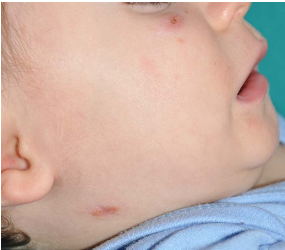
Figure 1. Two small red-yellowish papules on the lower right eyelid and the right submandibular area.

A 4 mm punch biopsy was performed; histologic findings are illustrated in Figures 2 and 3.