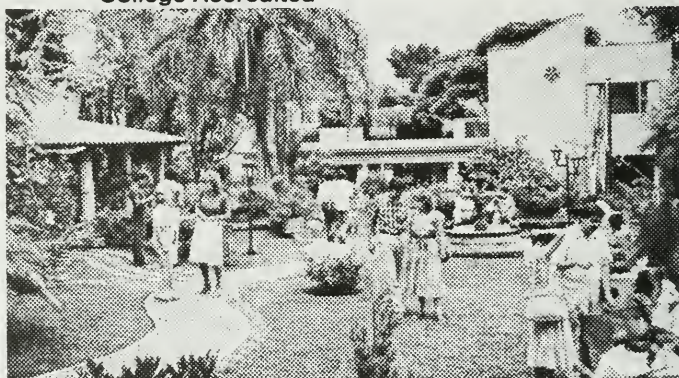
The Center for Bilingual Studies, Cuernavaca's most attractive and foremost Spanish Language Learning Center, is located in a quiet residential district of the city.