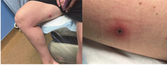
Figure 1. Painful, erythematous nodule with central necrotic eschar on right medial thigh.

further rule out African trypanosomiasis given the patient's extreme fatigue and travel history.