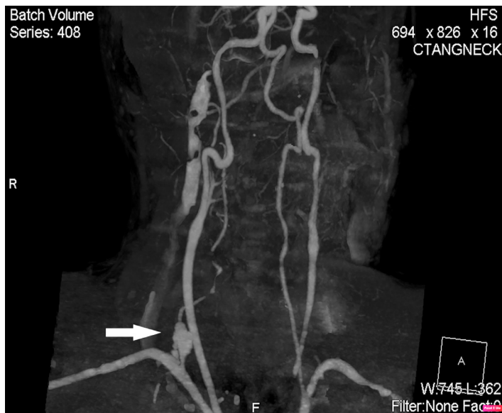
Image 2. Computed tomography angiogram showing an aneurysm (arrow) at the right vertebral artery origin with poor opacification of the remainder of the vessel.

PEA cardiac arrest due to exsanguination after evacuation of the right hemothorax. Despite ongoing resuscitation attempts, the patient expired in the operating room.