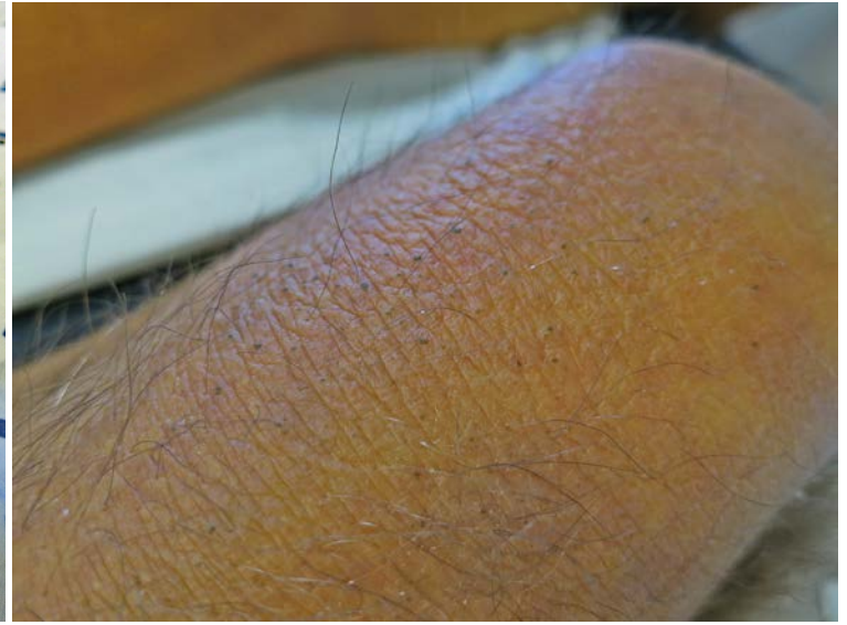
Figure 1. Pinpoint dark green macules seen on his fingertips and palms. Figure 2. Pinpoint dark green macules seen on his anterior thigh.