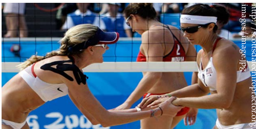
Kinesio tape (in black) helps to reduce lymphoedema collection in body tissues.

"Although the IOC (International Olympic Committee) bans competitors from putting unnatural substances in their bodies, athletes and their coaches have devised a way around this rule through a form of external doping."