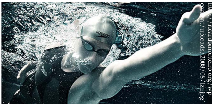
The LZR is designed with an area that compresses the swimmer's chest and abdominal area which allows the body to become more streamlined.

LZR is also designed with an area that compresses the swimmer's chest and abdominal area which allows the body to become more streamlined (Ward 2008). With