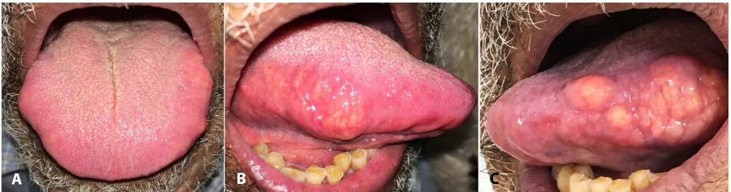
Figure 1. Symmetric lipomatosis of the tongue (SLT) in an 87-year-old man. Intraoral examination showed A ) normal dorsum, B, C ) soft yellowish masses with a smooth shiny surface on the lateral borders of the tongue bilaterally.

solitary lesion in any part of the body [1-4]. In this report, our patient had multiple yellowish nodules of the tongue, which were diagnosed initially as lipoma. Benign symmetric lipomatosis is differentiated from lipoma by specific characteristics, such as the findings of diffuse, nonencapsulated nodules usually involving multiple anatomic sites [9, 10]. The main items in the differential diagnosis include traumatic fibroma, angioliipoma, and neurofibroma [3]. However, although BSL is relatively rare in the oral region, it can sometimes develop bilaterally on the tongue and then is entitled SLT [9, 10]. The current case was deemed to be SLT and could not be BSL owing to occurrence of oral lesions and the absence of other extraoral features. A few cases of SLT in the tongue without involvement of other sites have been reported in recent years [1-4, 6].