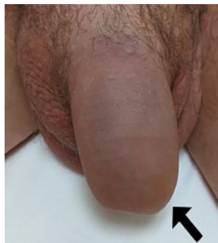
Image 1. Patient's penis with eggplant deformity (arrow) at presentation to the emergency department.

Dorsal Vein Rupture: This patient's ultrasound images showed hematoma external to Buck's fascia and intact tunica albuginea, suggestive of dorsal penile vessel injury (Images 2 and 3). This is a type of false penile fracture and requires only conservative treatment. 1 True penile fracture, with disruption of the tunica albuginea, can be exceptionally difficult to distinguish from false penile fracture, has a worse prognosis, and requires emergency surgery. 1 Along with history and physical exam, point-of-care ultrasound can help differentiate these entities. 2 Delay of presentation greater than 24 hours of penile fracture has been linked to an increased rate of postoperative complications; so expeditious diagnosis is important to help reduce the time to