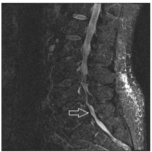
Image 3. Short T1 inversion recovery image of lumbar spine with arrow pointing to lipomatosis.