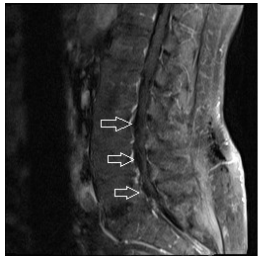
Image 1. T1 weighted sagittal view of lumbar spine with arrows pointing to epidural lipomatosis.

This case raises awareness of spinal epidural lipomatosis as an etiology to consider in patients with and without risk factors presenting to the ED with cauda equina syndrome.