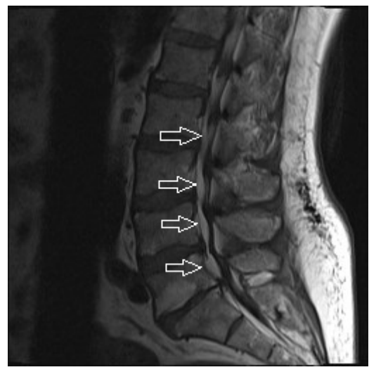
Image 2 . T1 weighted fat suppression sagittal image of lumbar spine with arrows pointing to lipomatosis (Blood would show bright in this view).