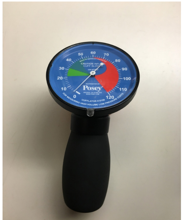
Figure 1. Posey Cufflator™ endotracheal tube inflator and manometer.

Data were collected by critical care paramedics and nurses and entered at the time of measurement into a data collection form created for the purpose of the study. These data were then transcribed to a computer database for analysis.