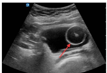
Image 3. Transabdominal ultrasound, in transverse, demonstrating a Foley catheter with balloon inflated (red arrow) in the right side of the urinary bladder

removal of a urinary catheter with the balloon inflated.<sup>3</sup> The most common injury sites are the posterior and bulbous urethra, and the most frequently reported injuries are false passages created by forceful catheterization, as well as mucosal and submucosal tissue tears caused by balloon inflation in an improper position in the urethra.<sup>3,9</sup> These complications may ensue even in consultation with experienced urologists. No matter what the cause, urinary catheterization is an inherently uncomfortable procedure. Multiple attempts can result in significant patient distress, as well as bleeding, urethral trauma and increased healthcare costs to both the patient and the hospital.