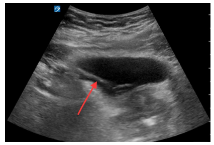
Image 2. A transabdominal ultrasound image of the urinary bladder in transverse view demonstrating a hyperechoic line (red arrow) representing the guidewire entering the bladder.

Urinary catheterization may be associated with complications such as traumatic insertion, creation of false tracts, urethral trauma, clogging of the catheter, and accidental or intentional