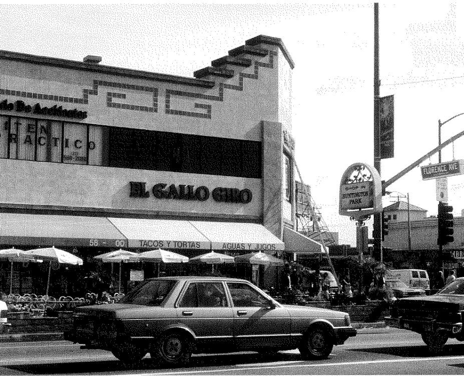
El Gallo Giro, owned by a Mexico-based food company, includes a restaurant, retail store, offices, production facility and sidewalk cafe.