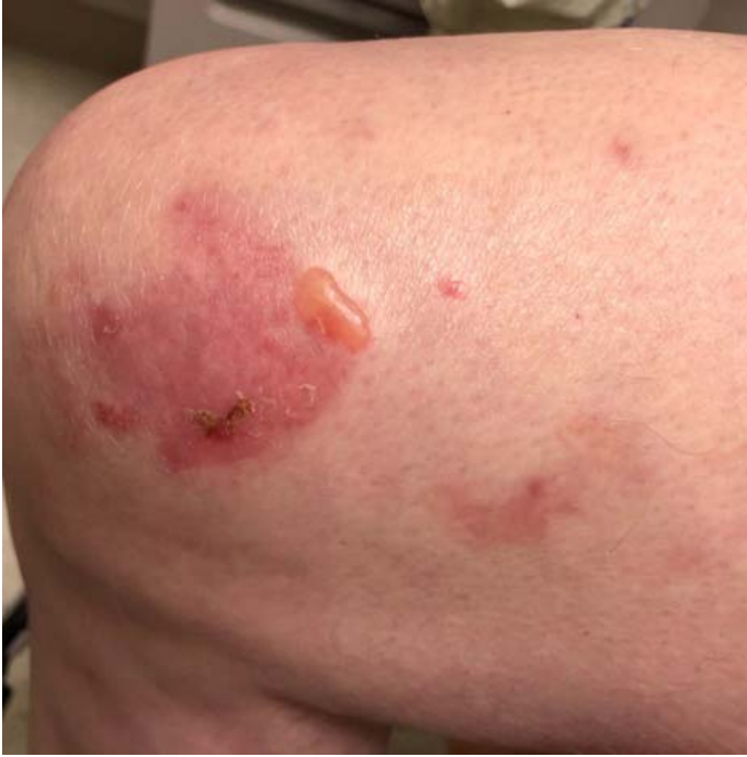
Figure 1. Clinical photograph demonstrating lower extremity with an erythematous patch and a tense bulla.

Physical examination demonstrated numerous intact, tense bullae, some with adjacent erosions and crusting, localized on the posterior neck, left posterior shoulder, abdomen, arms, and legs ( Figure 1 ). The largest bulla was approximately 3cm with several smaller 5-6mm vesicles. The oral and ocular mucosae were unaffected.