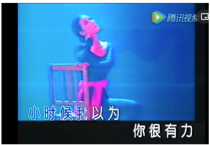
Figure 1. Video still from When I Grow Up, I Will Become You (director: Bai Zhiqun).

Figures 1 and 2). MTV works like this piece, not interested in presenting an intact dance choreography, normalize fragmentation and compartmentalization of movement. In other words, music videos actually provided an important aesthetic foundation for experimental dance films.