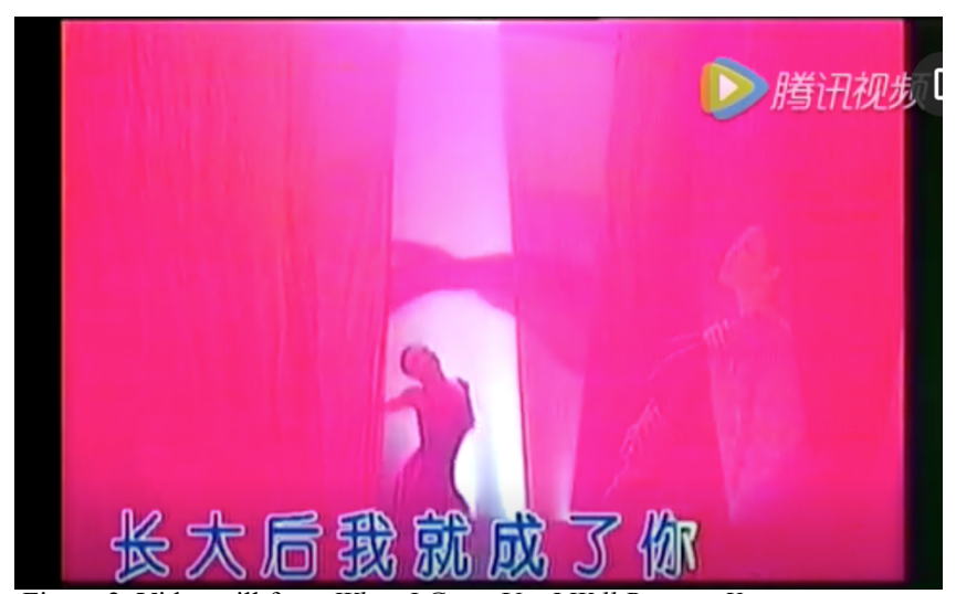
Figure 2. Video still from When I Grow Up, I Will Become You (director: Bai Zhiqun).

Besides the influence from Taiwanese MTVs, Bai also drew inspiration from early Hollywood film-musicals and socialist Chinese dance films to explore strategies to integrate