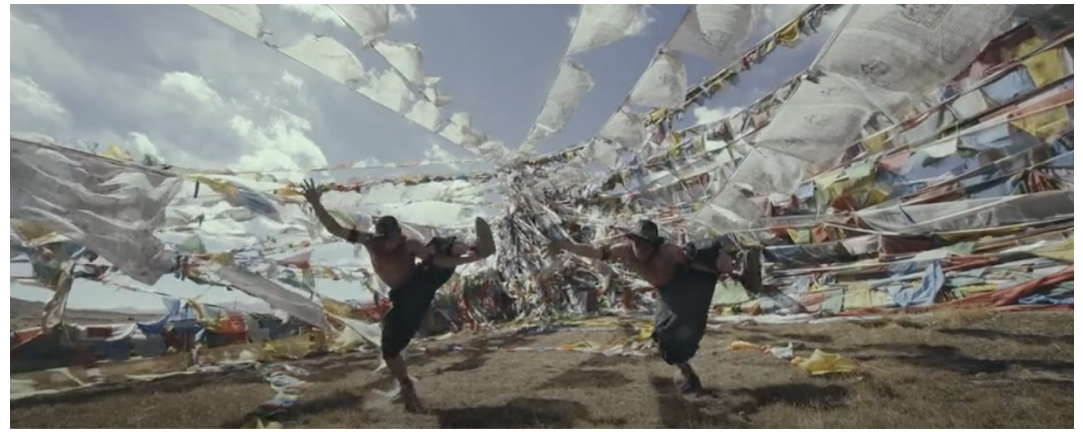
Figure 15. Film still from Gatha (director: Tang Chenglong).