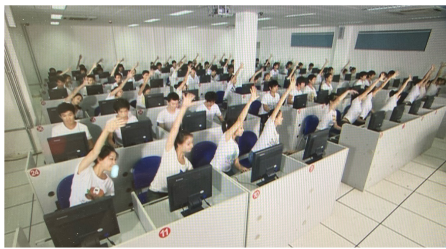
Figure 5. Video still from Dairies of Youth (director: Bai Zhiqun).

bodies to the left, to the right, and to the front, making a big circle with the entire body from sitting to standing to sitting again, and performing variations of the above-mentioned movement by speeding up the movement (see Figure 5). Choreographically, the stylization and rhythmic variations of gestures specific to a classroom setting reflect Bai's ongoing search for the coherence between the choreography and the site where it takes place. Some gestures appear overtly literal. But considering that Bai aimed to reach a broader audience, many of whom had limited knowledge of dance, this kind of choreography served to make dance legible to a lay audience.