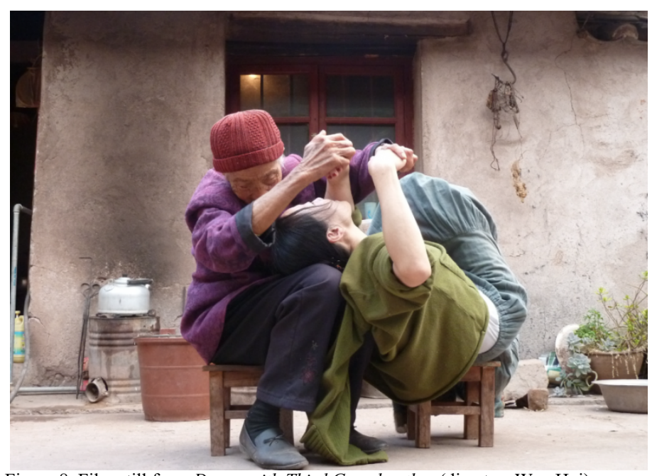
Figure 8. Film still from Dance with Third Grandmother (director: Wen Hui).