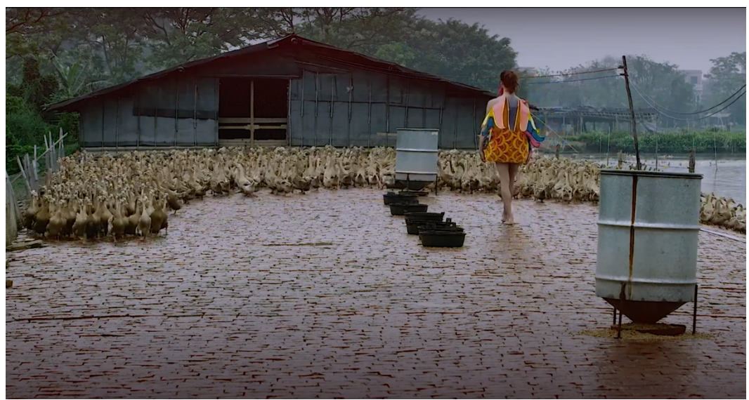
Figure 10. Film still from This Is a Chicken Coop (director: Ergao).

This Is A Chicken Coop is constructed through a collage of disparate visual compositions.