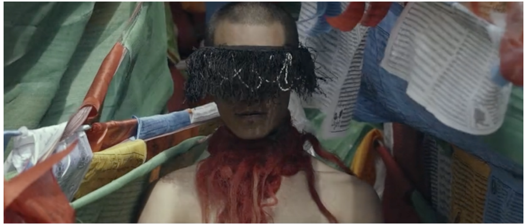
Figure 14. Film still from Gatha (director: Tang Chenglong).

hanging black threads fully covering the eyes encircle their heads. A necklace made of strings of red fur that resembles the hair of a lion surrounds their necks and covers their bare chests. The detailed depiction of unusually costumed half-naked male bodies intercuts with wide shots of the environment, which presents a sacred ground with voluminous strings of colorful Tibetan prayer flags (see Figure 14). This exotic and tribal-influenced costume contrasts with the robes they wore earlier, constructing the two performers as different characters from the two monks.