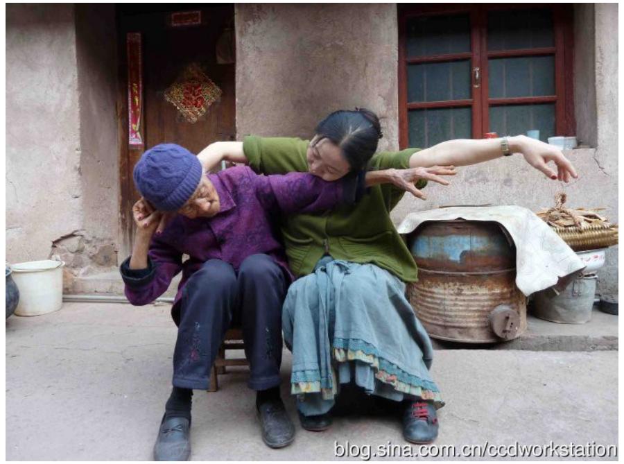
Figure 7. Film still from Dance with Third Grandmother (director: Wen Hui).