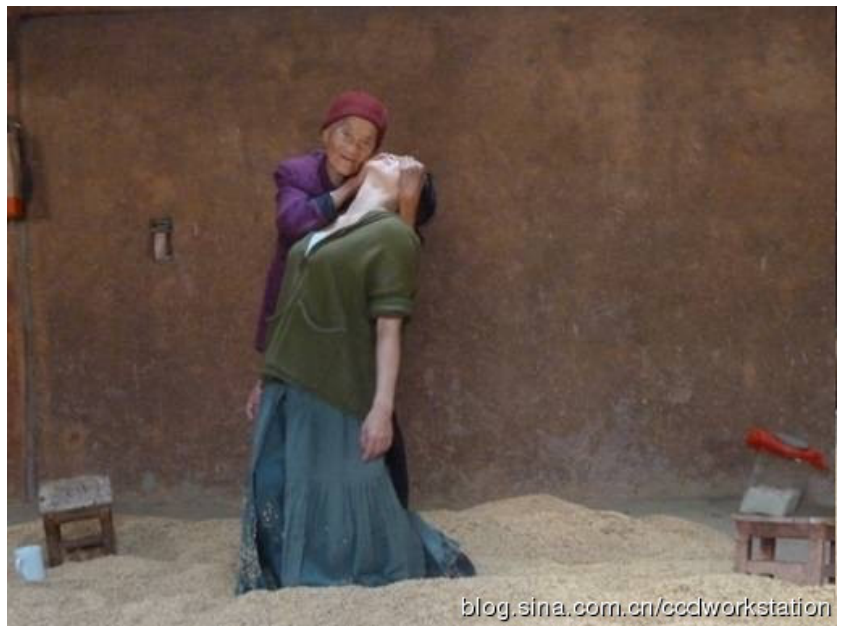
Figure 9. Film still from Dance with Third Grandmother (director: Wen Hui).

The corporeal exchange between Wen and Su on screen, documented through a portable digital camera and edited through a choreographic logic, became traces or remains of their original performance. While the documentary provides an audio-visual inscription of their encounter, this form of archive is inherently partial. The framing of the camera and the editing process constantly point to the selectiveness and partiality of recorded memories. In other words, the process of documentary filmmaking becomes a practice of reminiscence in relation to body, memory, disappearance, and forgetfulness. For instance, in Wen and Su's duet scene recorded by a camera fixed at the same position, a jump cut often disrupts the continuity of their movement. Jump cut is an editing technique that compresses a continuous take by removing a number of frames of the same take (Wang 2014). Cuts as such work to condense the film time while making visible the passage of time in the profilmic space. The choice of jump cut makes legible an intentional erasure of a part of their original performance in front of the camera, pointing to a space of loss, in-betweenness, disappearance and absence. While these long takes evoke the