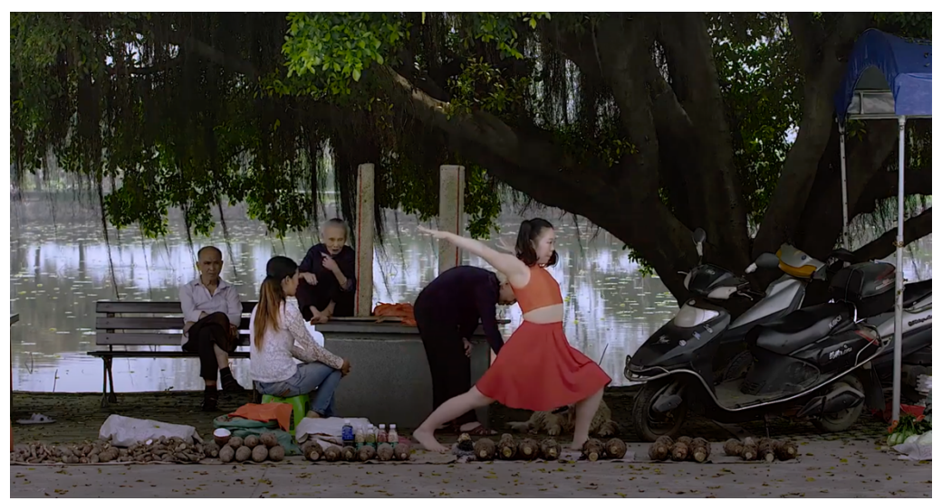
Figure 12. Film still from This Is A Chicken Coop (director: Ergao).

Similarly, in a scene taking place on the street, the locals, including a street vendor and three elderly men and women are having a conversation under a big tree to kill time. Their dialogue in Cantonese can be heard through the camera, making up one of the primary sound elements in the scene. Meanwhile, a dancer with pigtails sits on a motorcycle next to them, staring forward with an ironic smile. When the same scene reappears in the film, the dancer starts to perform robotic exercises, projecting vitality and youthful energy, whereas the elders continue engaging in their conversation (see Figure 12). These young characters' lack of bodily stillness projects an anxiety towards suspended time whereas the local residents are constructed to embody a calmness and contentment towards an elongated experience of time. In other words, the young girls and the villagers are constructed to embody contrasting temporal experiences.