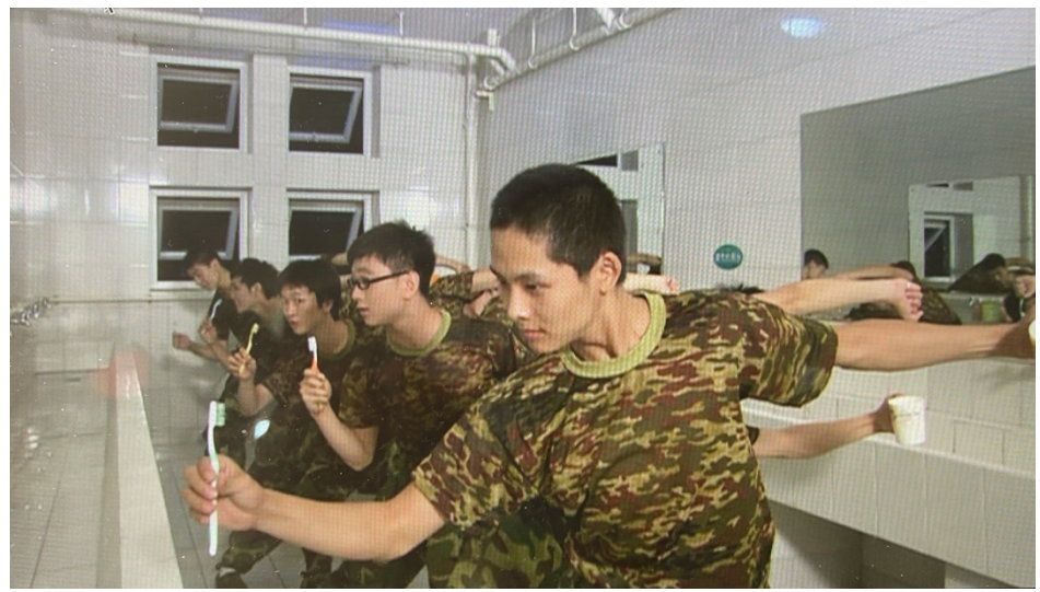
Figure 4. Video still from Dairies of Youth (director: Bai Zhiqun).

downstairs cuts to a close-up shot of someone dressed in a military uniform blowing a whistle. Then we see over one hundred male students running to line up in rows on a playground, turning their heads at an exaggerated speed to the left and to the right. In this short scene, the rapid cuts between shots that focus on choreographed everyday gestures heighten the sense of urgency. This urgency does not lead to chaos; rather, it reinforces orderliness.