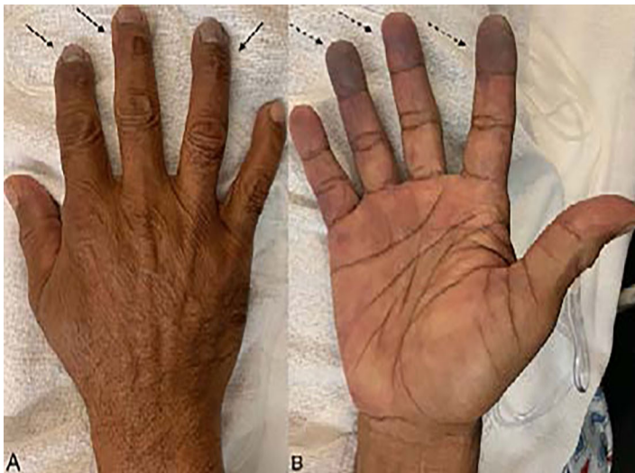
Image 3. Image of the right-hand post-tissue plasminogen activator (tPA) administration. The dorsal aspect of the right hand reveals subungual pallor (A). The palmar aspect of the hand post-tPA administration (pre-tPA not pictured), revealing a significant progression of the mottling and discoloration seen on initial presentation (B).

Common etiologies of acute finger ischemia include but are not limited to hypercoagulable states, atrial fibrillation, thrombangiitis obliterans, vasospasm, trauma, and neurovascular compression at the root of the upper limb. 1 This case demonstrates the importance of physical exam maneuvers such as neurovascular testing, assessment of capillary refill and Allen's test in diagnosing critical limb ischemia where a history of risk factors for arterial thrombi is absent. The