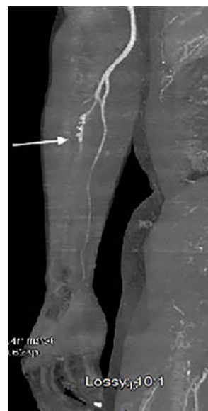
Image 1. Computed tomographic angiography of the right upper extremity revealing abrupt non-opacification of the ulnar artery approximately three centimeters below the takeoff of the interosseous artery (arrow). Non-visualization of the superficial palmar arch and metacarpal arteries.

His electrocardiogram showed normal sinus rhythm. His coagulation panel, laboratory and inpatient hypercoagulability workup was unremarkable. A computed tomographic angiogram of the right upper extremity displayed an ulnar-artery filling defect (Image 1). A heparin drip was initiated in consultation with vascular surgery. A formal angiogram of his upper extremity revealed a similar filling defect (Image 2A), at which point intra-arterial tissue plasminogen activator (tPA) was initiated. On hospital day two, the patient had a return of a strong ulnar pulse and improved perfusion to the affected digits (Images 2B, 3A, and 3B).