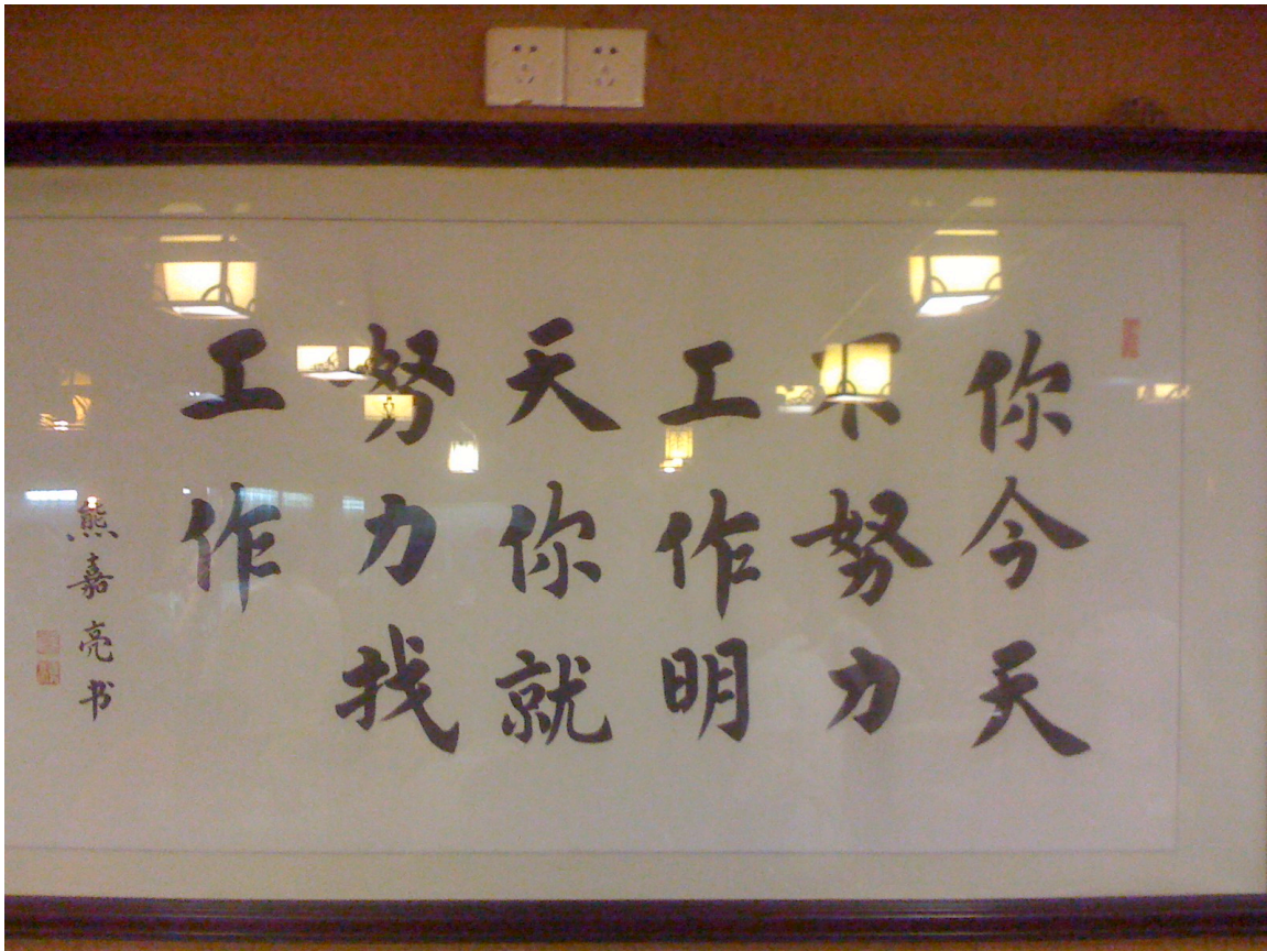
“If you don’t work hard today, you will work hard looking for a job tomorrow.”