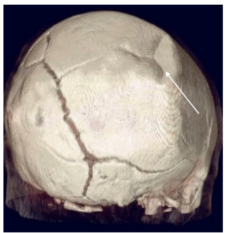
Image 2. Corresponding computed tomography with threedimensional reconstruction demonstrating "ping pong" skull fracture.