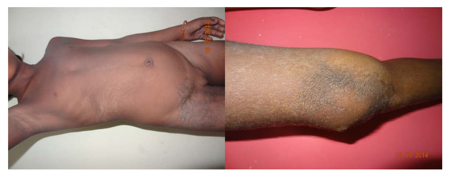
Figure 1.Hyperkeratotic plaques in Blaschkoid pattern on right side of body with accentuation of lesions in flexures (1a). Close up of lesions on knee (1b)