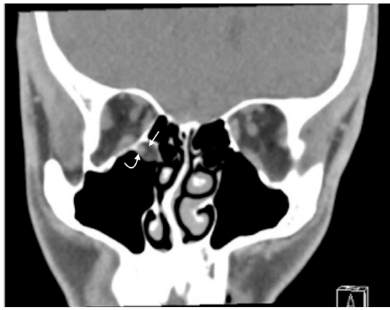
Image 4. Coronal non-enhanced CT in soft tissue window: Inferior rectus muscle (curved arrow) and orbital fat (straight arrow) in the extra-orbital maxillary antrum.