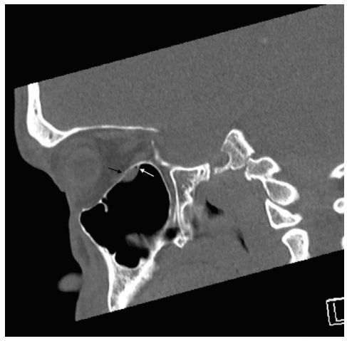
Image 3. Sagittal non-enhanced CT in bone window: Subtle defect in orbital floor (black arrow) with small focus of air adjacent to soft tissue density (white arrow).

24 hours is associated with improved outcomes.<sup>8</sup> Reported complications of delayed surgical repair include residual gaze restriction and diplopia secondary to ischemia of the extraocular muscle.<sup>9</sup>