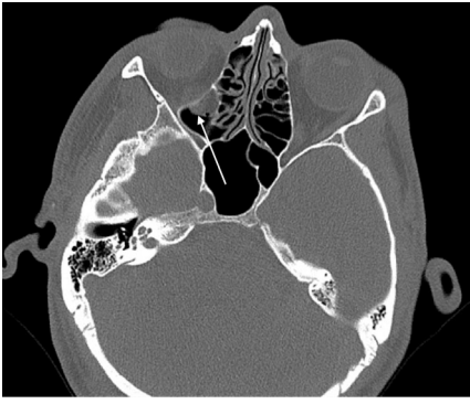
Image 2. Axial non-enhanced CT in bone window: Soft tissue density again noted in the maxillary antrum (arrow). No definite fracture.

muscles are tested through the full range of motion and close attention is paid to the location of the orbital soft tissues on CT.<sup>3</sup> The emergency physician must consider this diagnosis in younger patients with orbital trauma and abnormal ocular motility, even with a non-diagnostic CT, because operative intervention within