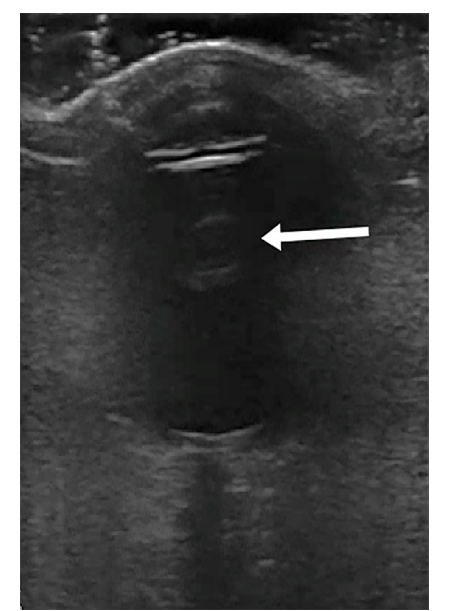
Image 2. Hyperechoic spherical structure seen in the posterior chamber of the left eye noted at the tip of the arrow.