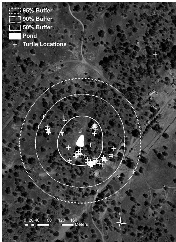
FIG. 3. Aerial photograph showing all terrestrial locations of Western Pond Turtles outfitted with radiotransmitters ( N = 12 ) and the various buffer distances that encompass percentages of those locations.