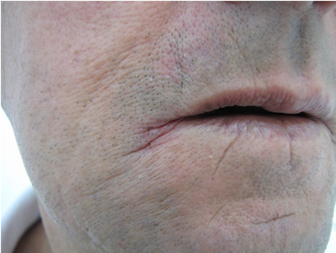
Figure 3. The lesion improved after 90 days application of pimecrolimus. Image shows partial regression after 2- years follow-up.

Intralesional infiltration with triamcinolone and cryosurgery were unsuccessful. Finally, there was a partial improvement with pimecrolimus topical cream twice daily for 90 days. There were no complications. The response to pimecrolimus was good, although a total remission was not achieved, even after a follow up and treatment of 2 years (Figure 3).