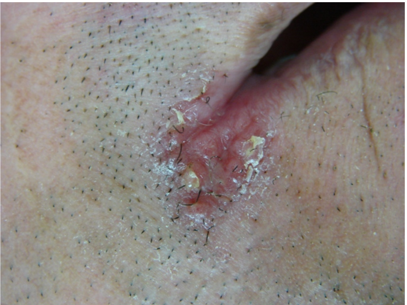
Figure 1. Erythematous-violaceous plaque, ulcerated on the corner of lip

The pathological study of an incisional biopsy showed normal epidermis and a dense dermal infiltrate composed of mature plasmacytes, lymphocytes, and some neutrophils (Figure 2). Russell bodies were occasionally observed.