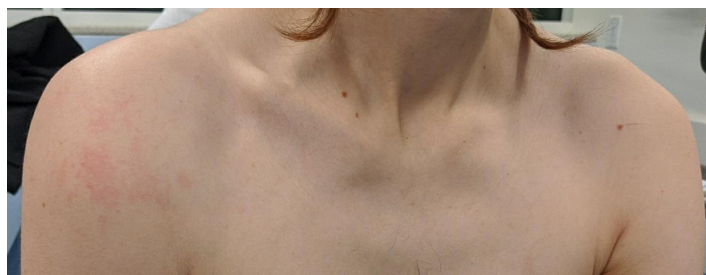
Image 1. Photo of patient demonstrating asymmetric swelling of the right shoulder.

The treating emergency physician performed a point-of-care ultrasound to evaluate for a right shoulder hemarthrosis. This exam was performed using a curvilinear 5-2 megahertz probe (Sonosite, Bothell, WA). While standing behind the patient, the probe was placed parallel to the ground just below the scapular spine. The probe marker was oriented to the patient's left, which allows the