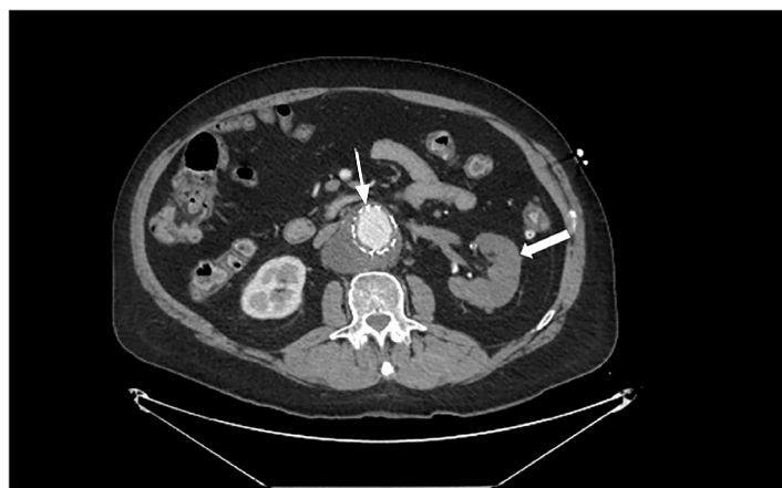
Image 1. Computed tomography with contrast in axial view demonstrating thrombosed endoluminal aortic stent (thin arrow) and infarcted left kidney (thick arrow).

EVAR has become more common in recent decades as the technology has improved. This is an especially viable option for high-risk patients with comorbidities who may not tolerate open repair. Overall, EVAR has a lower 30-day mortality, perioperative morbidity, and a shorter recovery period compared to open repair.