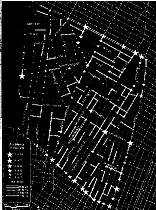
The Pedestrian Projects Group has developed analytical approaches and graphic techniques that resemble those used by traffic engineers. Left: Classification of streets in Forest Hills, Queens, according to pedestrian characteristics. Right: Pedestrian-vehicle accident frequencies in Greenwich Village.

Although pedestrian projects are often modest in scope, they relate operations to capital planning,