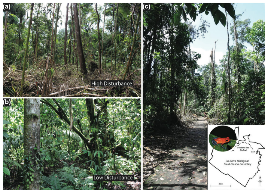
FIGURE 1 The impact of a novel extreme disturbance at a tropical field station. Photos show the impacts of a novel windstorm along study transects that we characterized as (a) high or (b) low- disturbance. (c) A map of the location of the study site at La Selva Biological Station (Heredia Province, Costa Rica, 10.43, -84.00) shows the focal species and main trail where transects were performed. Note that low-disturbance areas are representative of the typical habitat that our focal species, the strawberry poison frog ( Oophaga pumilio ), inhabits

While various species traits across taxonomic groups could be of relevant interest following this storm, we focus here on the change to UV-B conditions due to the biological relevance of ultraviolet radiation to our study species. In this study we quantified UV-B exposure in the disturbed habitat and evaluated whether increases in UV-B as a result of opened light gaps affected O. pumilio perch selection behavior. Ultraviolet radiation is known to negatively impact amphibian species through a range of lethal and sub-lethal effects across life stages. For example, in developing amphibians, UV-B exposure reduces amphibian larval survival, growth, locomotor performance, and induces developmental abnormalities. Malformations during development have been shown to alter behavior later in life, especially predator escape behaviors, which may have long-term consequences for fitness and population recruitment (Alton & Franklin, 2017). Adult amphibians exposed to increased ultraviolet radiation have been observed to suffer increased skin damage and mortality, and may experience the physiological costs of DNA repair in response to UV-B damage (Londero et al., 2019; Zavanella & Losa, 1981). Coupled with other stressors such as contaminants, pathogens, or environmental destruction, the effects of UV-B exposure on amphibians may be magnified (Blaustein & Kiesecker, 2002).