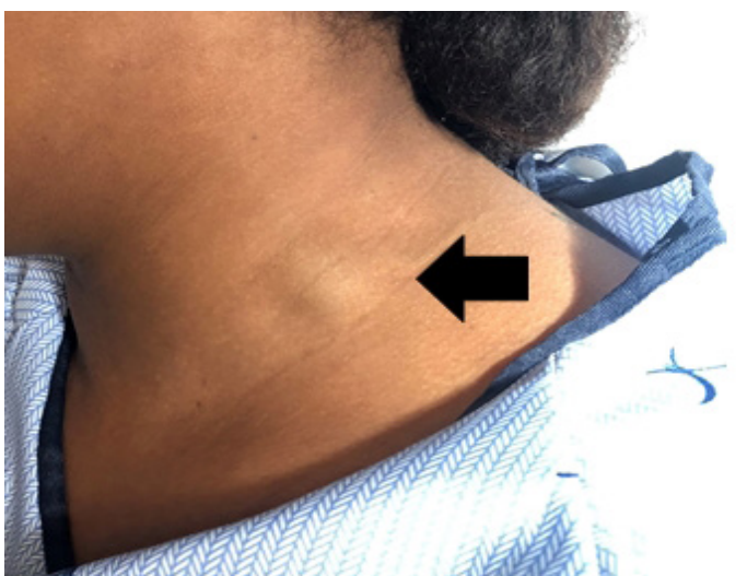
Image 1. Two-centimeter left external jugular pseudoaneurysm as seen on physical exam.

no signs that the pseudoaneurysm was expanding, causing airway compromise, had active extravasation, or was causing emergent neurological involvement at that time. We agreed she was safe for discharge at that time and could follow up with vascular surgery as an outpatient.