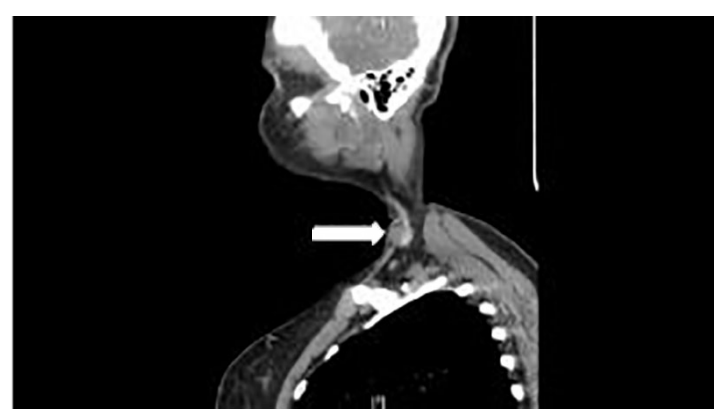
Image 3. Computed tomography with contrast sagittal view of left external jugular venous pseudoaneurysm (arrow).

Venous aneurysms are classified as primary (congenital) and secondary (acquired).<sup>2,5,8</sup> Causes of primary venous aneurysms are not fully understood,<sup>9,13</sup> while possible etiologies for secondary aneurysms within the venous system include thoracic outlet obstruction, trauma, chronic inflammation, degeneration, and increased venous pressure.<sup>2,4,5,11,14</sup> Known risk factors for secondary venous aneurysms include recent trauma, cardiovascular disease, and age.<sup>3</sup>