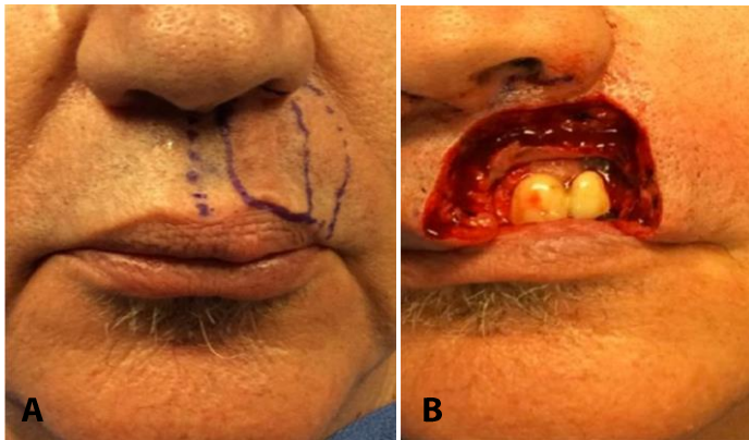
Figure 2. Site of tumor following 3 months of Vismodegib treatment with the inability to clinically differentiate scar tissue from residual tumor (A). Defect following 1 stage of Mohs micrographic surgery (B).