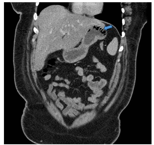
CT Video Link: https://youtu.be/zMVLLRbTB0w