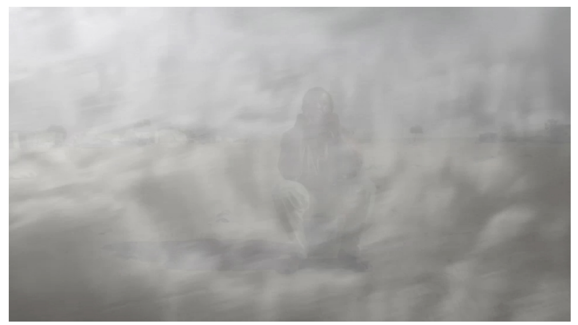
Figure 1. REJECTED 02/12 (video still from REJECTED, 12 videos © Sophie Bachelier & Djibril Diallo, 57th Venice Biennale 2017, Venice, Italy, Tunisian Pavilion, The Absence of Paths , May 13th–November 26th, 2017, by permission of the artists).

Some of the same concerns that Peskine's Raft of the Medusa brought forward in Dakar continued to be addressed by artists at the following Venice Biennale. Despite the claim that the 2017 Venice Biennale was backing away from the forthright politics of artistic director Okwui Enwezor's 2015 All the World's Futures , it was clear that the global migration crisis in general and the Mediterranean crisis in particular were of concern for many artists and national pavilions. Several countries deliberately chose African and African diasporic artists to be their country's representative to address this crisis as well as to point a finger at the depressingly low number of Black artists in the 57th Venice Biennale. One insightful critique penned by art critic M . Neelika Jayawardane of this seeming backlash put it plainly: "If it were not for the handful of African national pavilions, the 57th edition of the Venice Biennale would have looked mostly like a Europe that had closed its borders. Angola, Côte d'Ivoire, Egypt, Kenya, Nigeria, South Africa, Tunisia, Zimbabwe were the only representatives of Africa in the Biennale."<sup>28</sup>