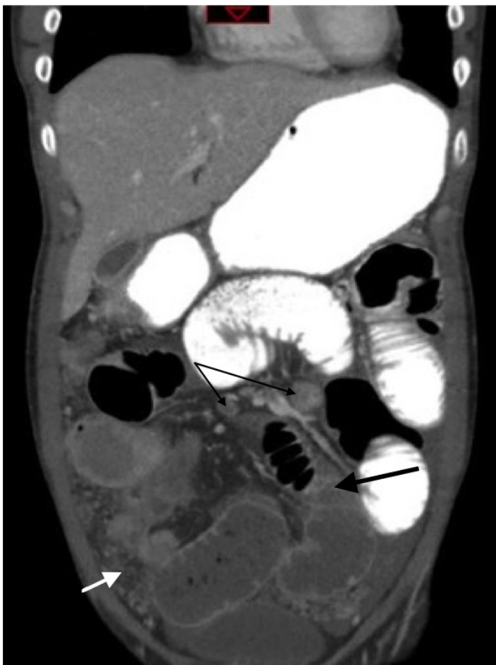
Image 1. Coronal computed tomography with oral contrast showing oral contrast not completing its path through the bowel (thick black arrow), indicating presence of high-grade obstruction. Also visualized are large mesenteric lymph nodes (thin black arrows), peritoneal studding, and omental caking (white arrow).

He was admitted to the surgical service. Upon further chart review, the patient was shown to have a positive QuantiFERON® test in 2014 while taking adalimumab and azathioprine, which was never addressed. A colonoscopy was performed to attempt biopsy of the affected tissue, but could not pass through the terminal ileum due to the high-grade obstruction. An exploratory laparotomy was subsequently performed to obtain a definitive diagnosis, as the differential was still broad and included abdominal sarcoidosis, TB, and coccidiomycosis.