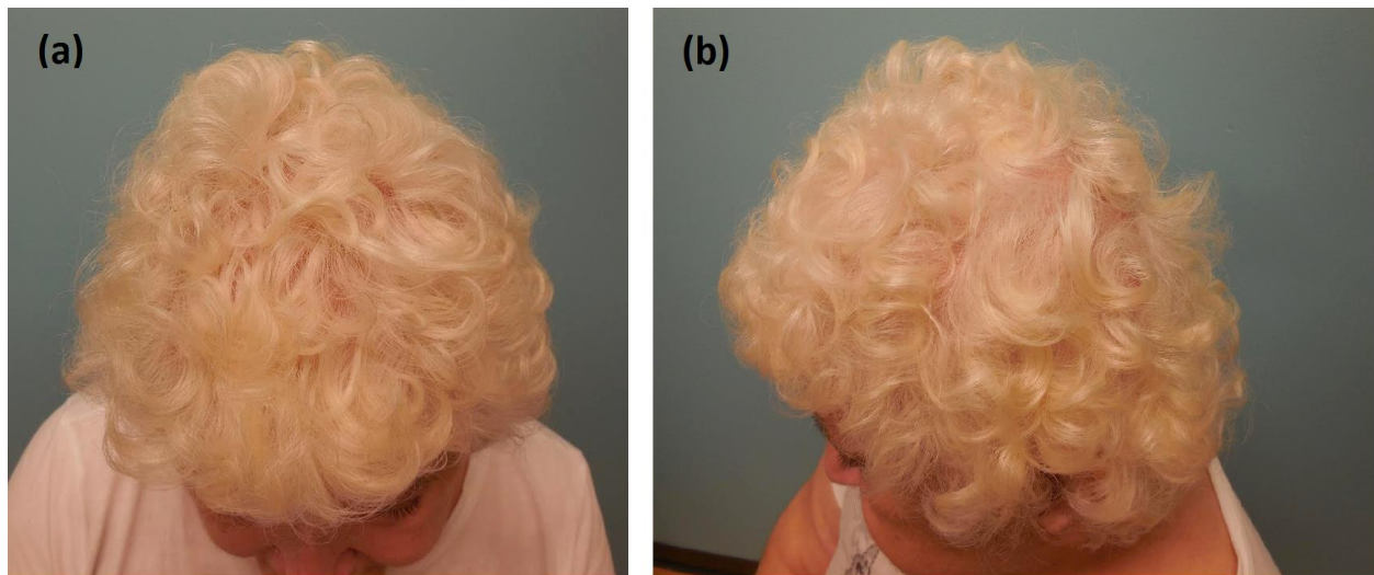
Figure 1. (a, and b). Front (a) and side (b) views of the acquired yellow scalp hair in a white-haired woman after application of bacitracin zinc in the evening followed by occlusion overnight under a shower cap, then subsequent shampooing of the hair with selenium sulfide lotion the following morning. The patient reported no new scalp symptoms occurring with discoloration.

At her follow up visit, the patient complained of yellow scalp hair discoloration that only occurred on days following the use of selenium sulfide lotion. Cutaneous examination showed patches of orange-yellow hair, with white hair remaining in untreated areas (Figure 1).