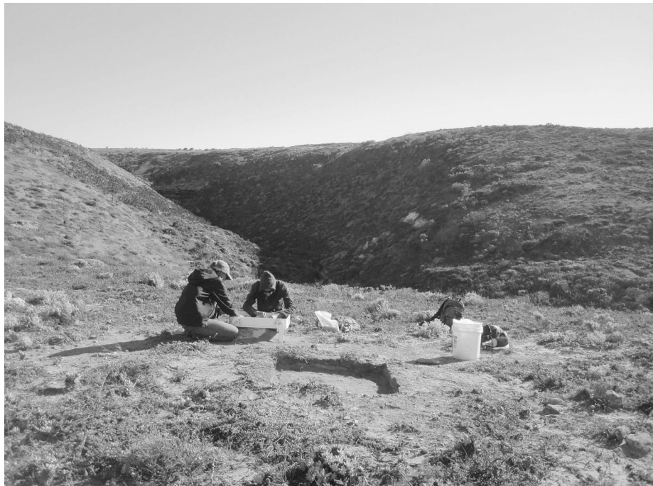
Figure 3. K. Gill (left) and A. Ainis screening sediments from the shallow Unit 1 excavated in the western portion of CA-SMI-274. The east fork of Willow Canyon is seen in the background (facing south, 2012 photo by J. Erlandson).

To help further document the nature of this ancient and significant site, Erlandson, A. Ainis, and K. Gill excavated a shallow 1 x 1 m. test unit (Unit 1) atop the knoll in the western part of CA-SMI-274 (Fig. 3). Essentially a surface scrape, Unit 1 encountered just over 10 cm. of intact shell midden soil, producing 109 liters of sandy soil that was screened over 1/8-inch mesh in the field. Laboratory analysis of the screen residuals from Unit 1 produced 16 chipped stone artifacts, including one possible flake tool of siliceous shale and an assortment of non-diagnostic tool-making debris made from Tuqan/Monterey chert (n=6), siliceous shale (n=3), Cico chert (n=4), and quartzite (n=1). Also recovered were very small amounts of charcoal, one small fragment of red ochre that may or may not be of natural origin, and land snail ( Helminthoglypta ayresiana ) shells that are almost