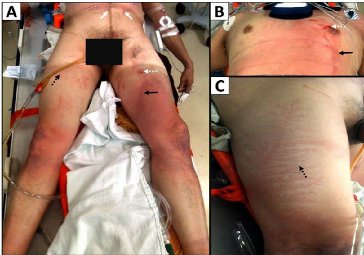
Image 1. Cutaneous injuries on patient one: (A) Small superficial thermal burns where the patient's belt buckle contacted the skin (white arrows). Lichtenberg figure lesions on anterior right thigh (black dotted arrow). Superficial punctate burn on left anterior thigh (white dotted arrow). Dark linear flash burn on left anterior thigh (black arrow). Dark purple ecchymosis is visible on the patient's knees from his fall to the ground after the strike; (B) Superficial linear flash burn (black arrow), punctate burns (white dotted arrow), and small abrasions over left nipple; (C) Lichtenberg figure lesions on the lateral right thigh (black dotted arrow).

that can be superficial or full thickness. They are typically very small and do not require medical treatment. 7,11 Patients struck by lightning may also suffer serious thermal burns from metallic accessories or objects contacting their skin. The short contact duration (tens of milliseconds) and relatively high resistance of the epidermis often prevents significant direct tissue heating damage due to the electrical current alone; but the strike can quickly heat any metallic objects, such as a necklace or belt buckle, that in turn can cause severe thermal contact burns. 7,12-14 Thermal burns may also occur if a victim's clothing ignites.